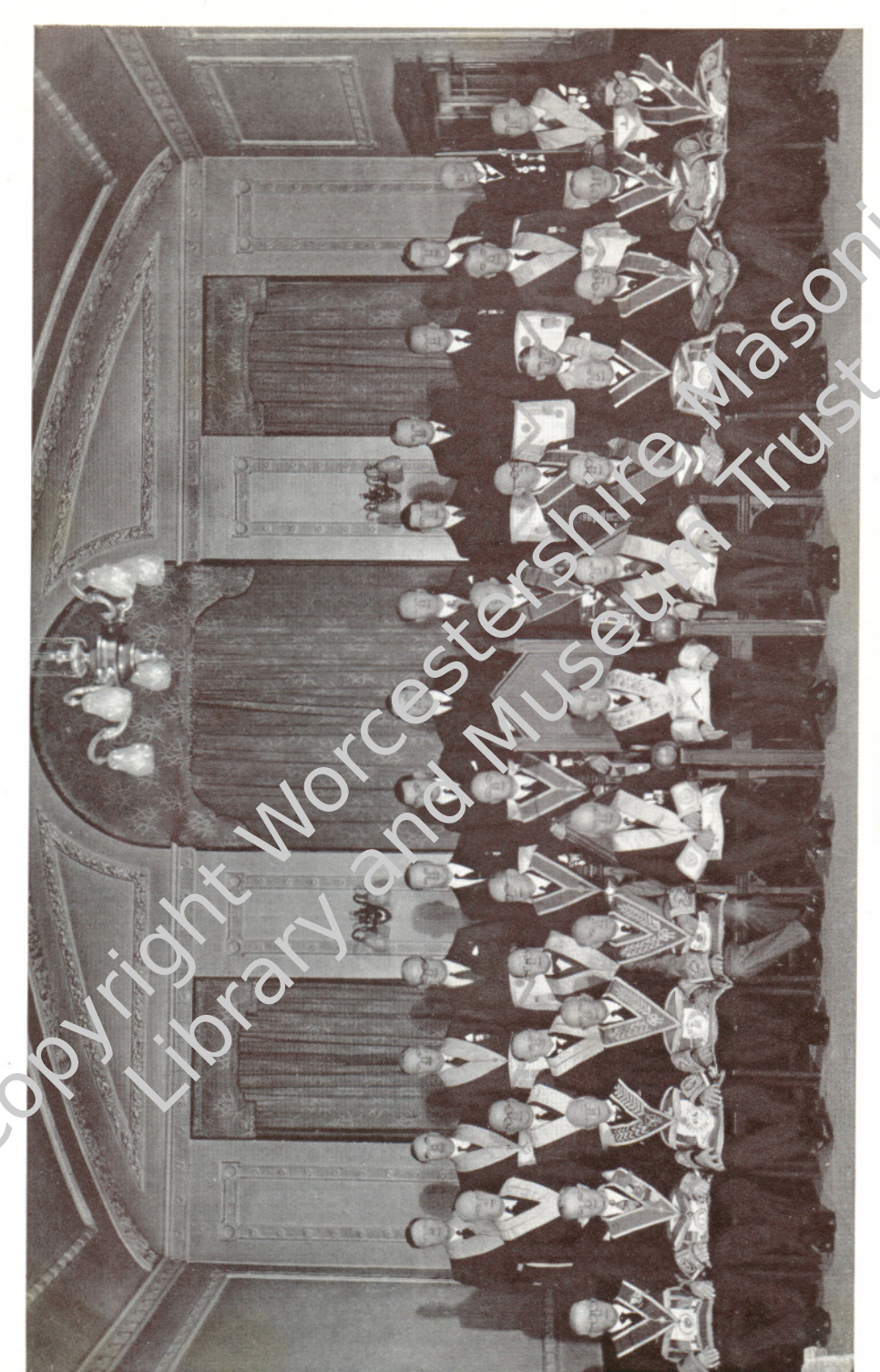
MEMBERS, May 28th. 1949